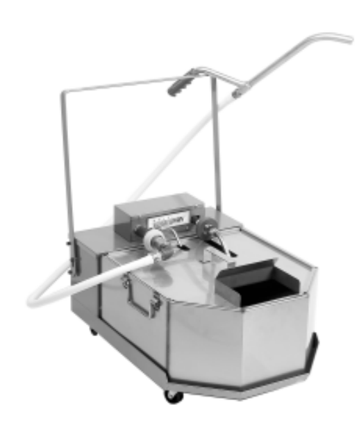
Model FFM80 shown

180 North Anets Drive • Northbrook, Illinois 60062 • 847-272-0770 • Fax 847-272-1943 For ANETS Factory Warranty Service • 800-837-2638